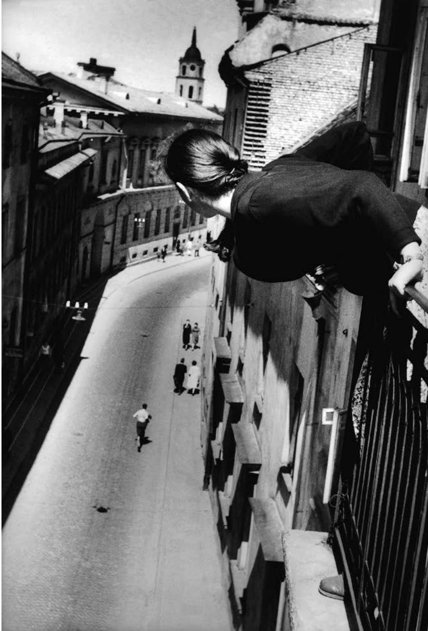
1. Antanas Sutkus, Maratonas universiteto gatvėje , Vilnius, 1959, 37 × 55,3 cm, atspaudas ant matinio popieriaus 50 × 60 cm, sidabro želatininis atspaudas, Antano Sutkaus nuosavybė, LATGA, Vilnius 2021